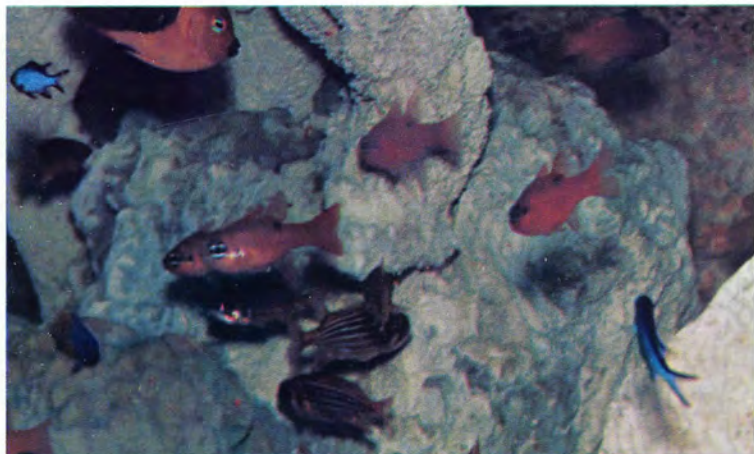
See coral reef fishes from the waters of the world swim in authentically reproduced underwater scenes that let you view the creatures of the deep in true life-like settings.