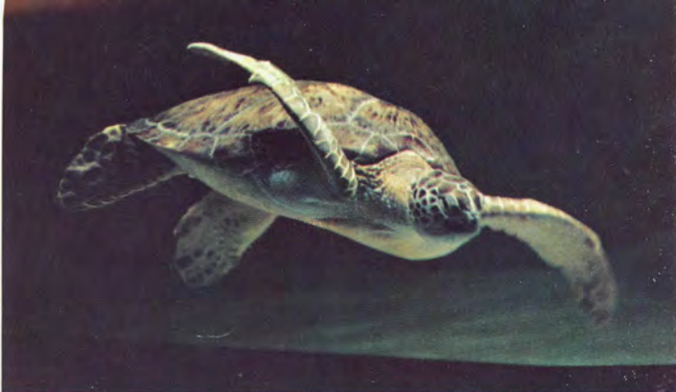
Over 200 million years ago there were turtles in the ancient seas remarkably like the 350 pound sea turtles at the Aquarium.