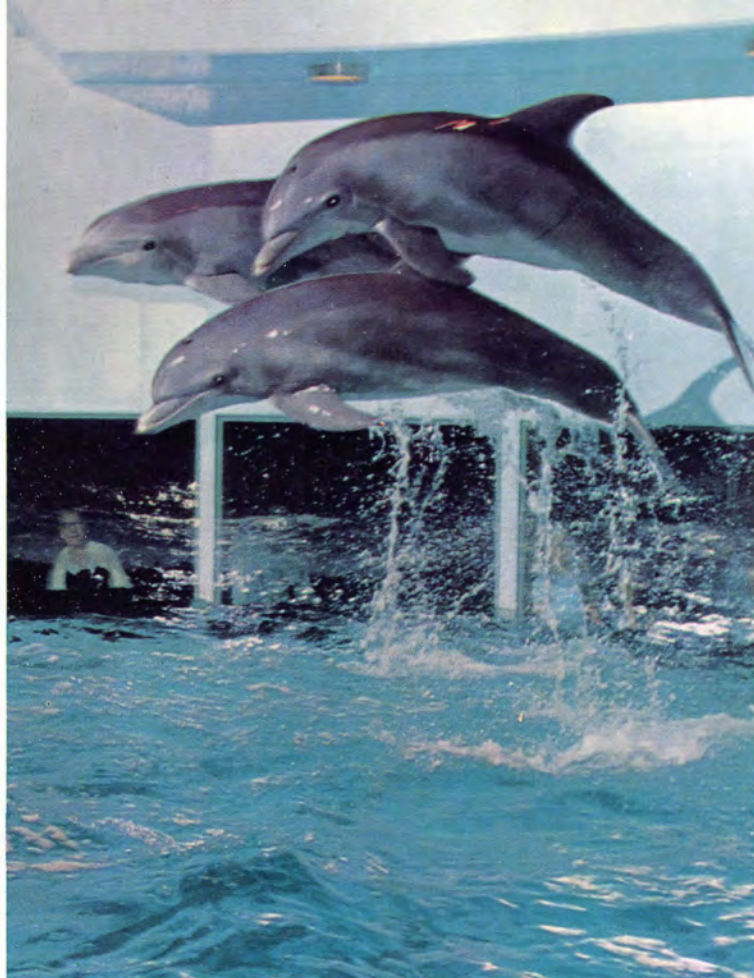
View the dolphin show from the double-tiered upper deck or watch the action above and below the water simultaneously through the unique split level viewing arrangement on the ground floor.