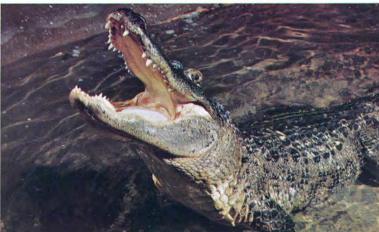
The creatures of the waters are beautiful and grotesque, docile and aggressive, friendly and fierce. The alligators at the Aquarium combine the best of the worst features.