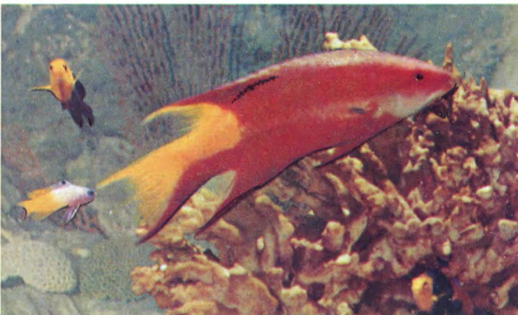
This is a close-up of one of the most beautiful tanks in the Aquarium. It contains exotic tropical fish which absolutely glow like brilliant jewels in every color of the rainbow.