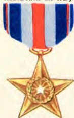
ARMY SILVER STAR