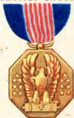
ARMY SOLDIER'S MEDAL