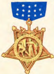
NAVY MEDAL OF HONOR