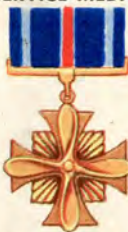
ARMY AND NAVY DISTINGUISHED FLYING CROSS MEDAL