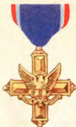
ARMY DISTINGUISHED SERVICE CROSS